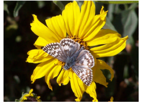
Common Checkered Skipper

August 1: OGDC meeting, 6:30 at the Nature Center